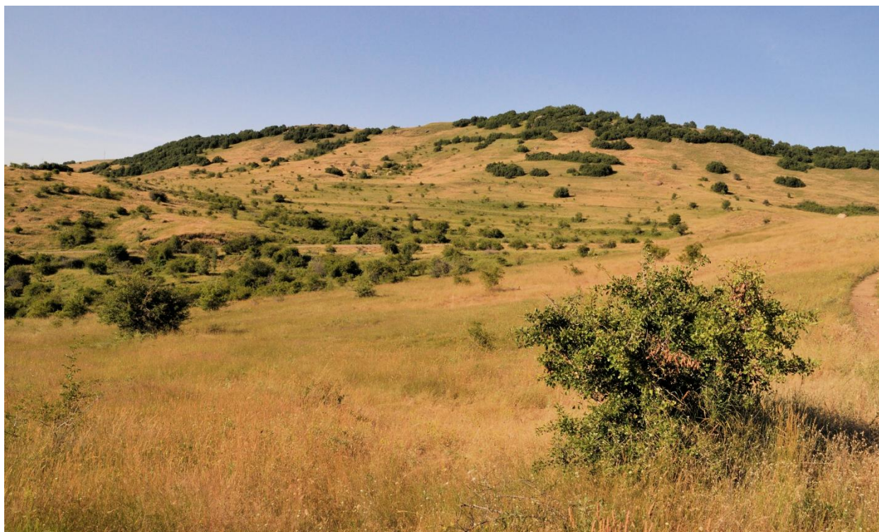
Figure 4: Štavica pass.