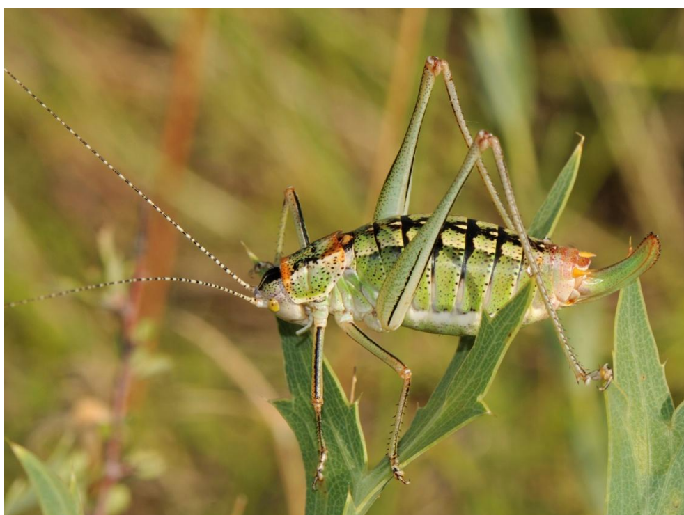
Figure 3: Poecilimon vodnensis ♀ - Štavica .