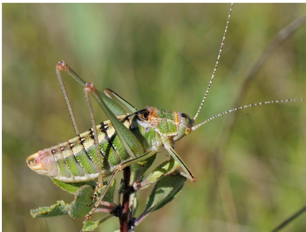
Figure 2: Poecilimon vodnensis ♂ - Štavica.

As already reported by Mladen Karaman in his original description in 1958, we can see a morphological proximity of P. vodnensis with taxa of the P. zonatus group and also P. varicornis , only represented in Turkey and the Middle East. Some future comparative researches, including cytogenetic and DNA, should provide a better vision on this possible link and its origin.