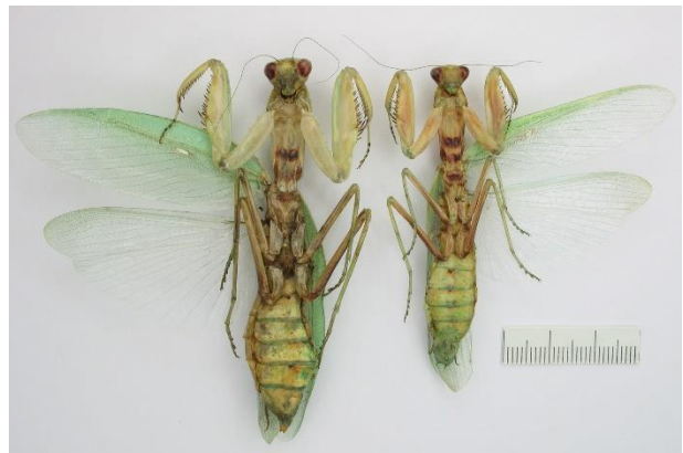
Fig. 11: Hierodula transcaucasica BR. V. WATTENWYL, 1878 from Katerini, Greece, male and female in ventral view.