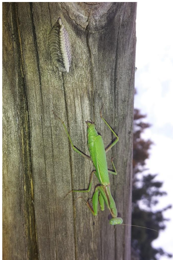
Fig. 7: Iris oratoria (LINNAEUS, 1758) from Vehra, with ootheca; Photo © M. Schmeißer.

This Mediterranean mantis also has a colonization history, having invaded California in 1933 (STROHECKER 1952, GURNEY 1955). Today, in the USA it is found as far east as western Texas (ANDERSON 2018). Its interactions with native Stagmomantis species have been studied by MAXWELL & EITAN (1998). A single female of this species has been found in Henschleben-Vehra, Thuringia, Germany (51°8'54.50" N, 10°59'17.05" E) on September 29, 2017 (HARTMANN et al. 2018). It was repeatedly seen until October 13, and also deposited an ootheca (Fig. 7). We received the ootheca one year later for study (to be deposited in the NMB) and it turned out it had successfully hatched. However, the long-term survival of this species north of the Alps is highly unlikely.