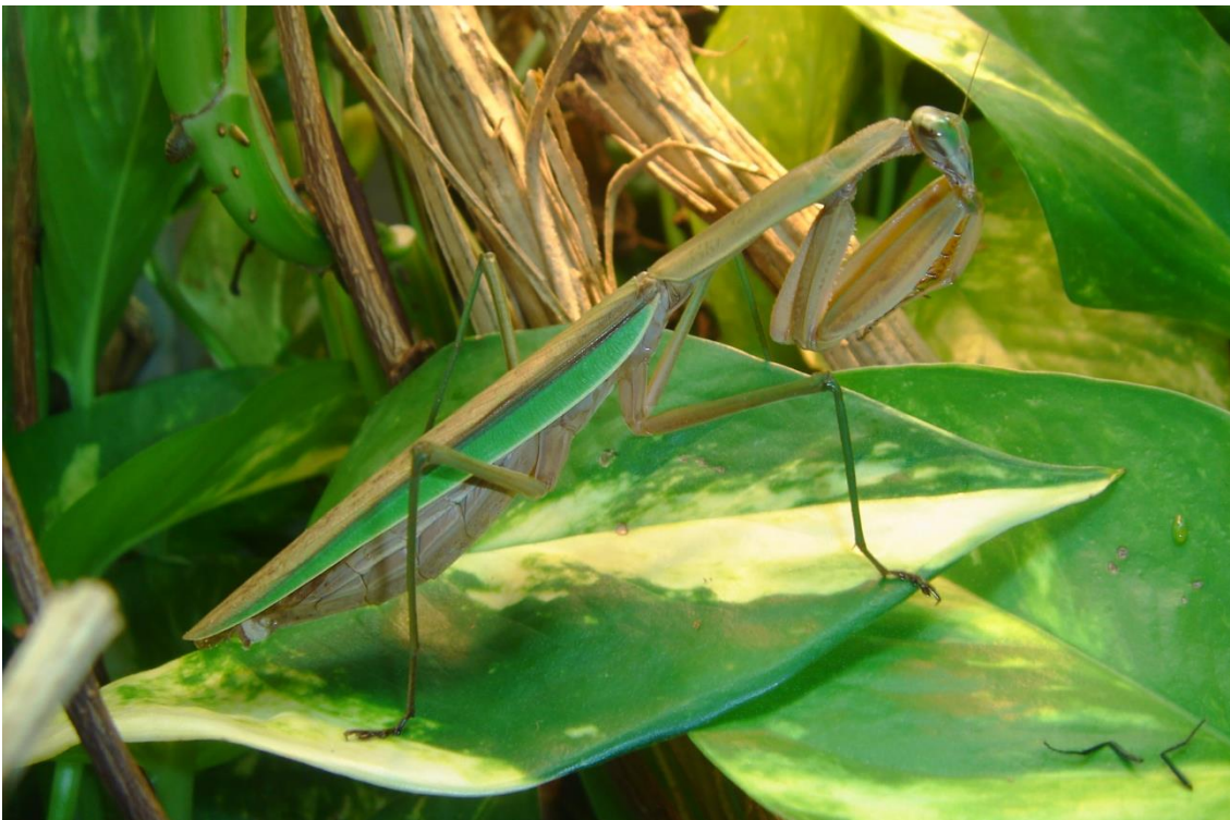
Fig. 6: Live aspect of Tenodera sinensis SAUSSURE, 1871 from Landau-Sieboldingen; Photo © B. Schaub.