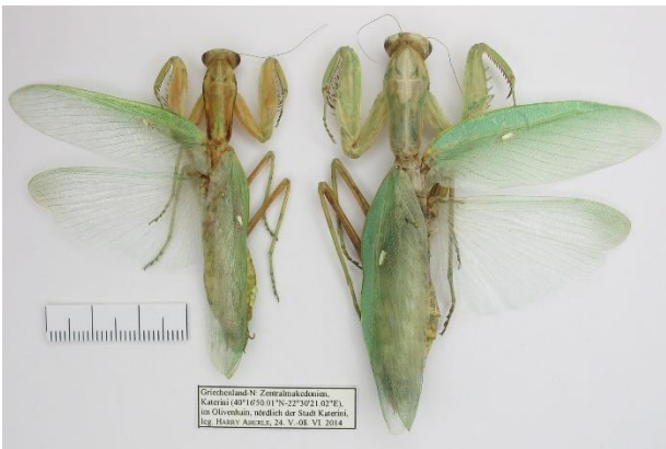
Fig. 10: Hierodula transcaucasica BR. V. WATTENWYL, 1878 from Katerini, Greece, male and female in dorsal view.