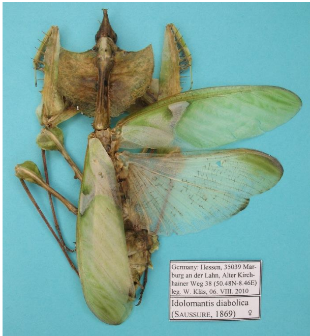
Fig. 12: Idolomantis diabolica (SAUSSURE, 1869) from Marburg a. d. Lahn, Germany.