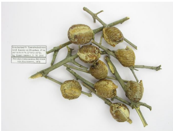
Fig. 4: Hierodula transcaucasica BR. V. WATTENWYL, 1878 from Katerini, Greece: oothecae.