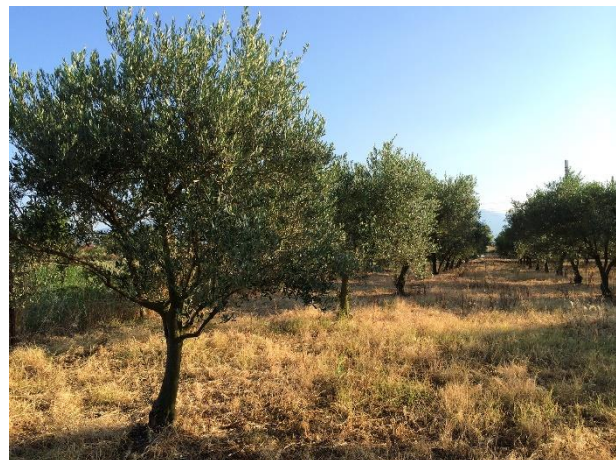
Fig. 5: Hierodula transcaucasica BR. V. WATTENWYL, 1878 from Katerini, Greece: habitat.