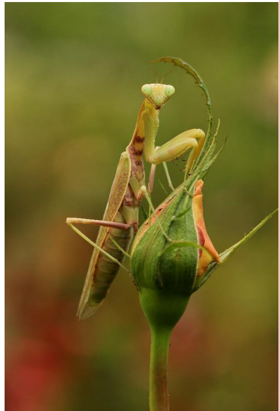
Fig. 2: Hierodula transcaucasica BR. v. WAT- TENWYL, 1878 from Katerini, Greece: portrait of male, showing prosternal pattern; Photo © C. Barth.