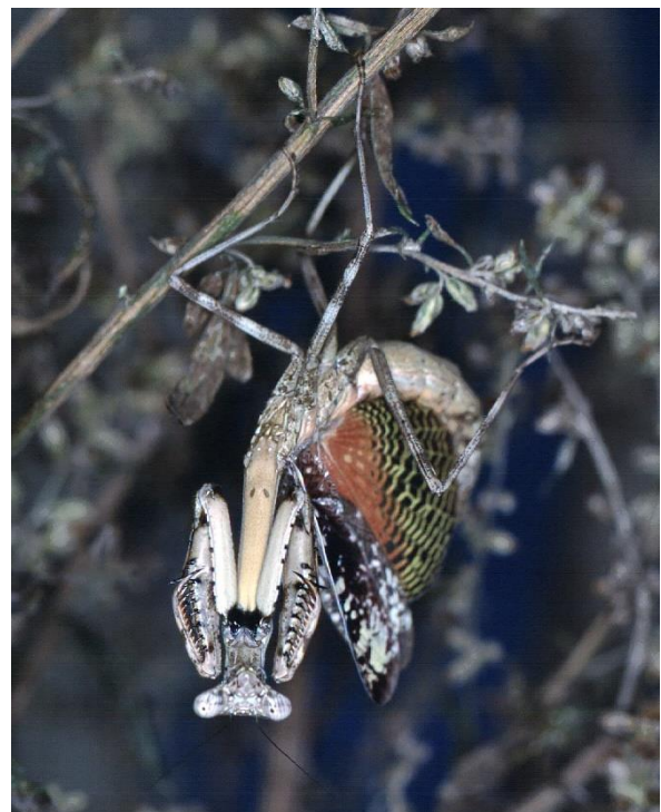
Fig. 14: Displaying female of Stagmomantis carolina (JOHANSSON, 1763) from an ootheca transported from Mexico to Germany via a Chamaedorea palm.

In September 2000, an ootheca was found attached to the underside of a leaf of the parlour palm or "Chico", Chamaedorea elegans . Leaves of this palm are used in Europe for flower arrangements. The respective palm originated in Juan Aldama, Durango, Mexico (24.16°N 103.22°W), where it had been imported from by a Dutch plant trader.