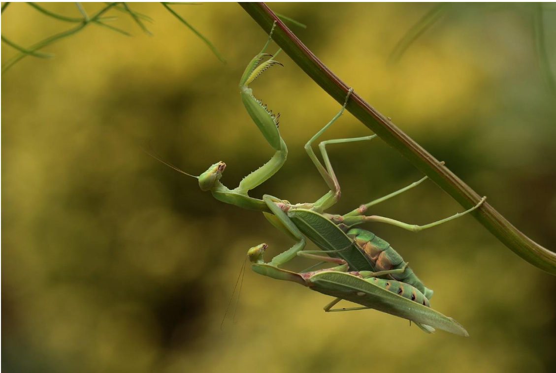
Fig. 3 Hierodula transcaucasica BR. V. WATTENWYL, 1878 from Katerini, Greece: pair in copula; Photo © C. Barth.