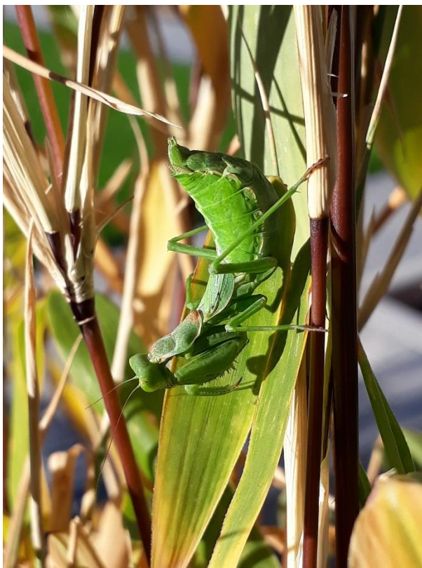
Fig. 1: Ameles spallanzania (ROSSI, 1792), female from Graben-Neudorf

Additional Greek and Macedonian records are provided by CIANFERONI et al. (2018). How the species might have reached Greece remains unknown. However, the occurrence at vastly different sites in Greece and neighboring countries raises the assumption that the species occurred in Greece for some time and, once established, colonized additional habitats on the Balkan Peninsula and adjacent islands. Interestingly, there are no reports of this species from western Anatolia (EHRMANN 2011a), so we regard its presence west of the Aegean Sea to have been more likely aided by man (cargo and other means of adventive transport) than the result of natural dispersal.