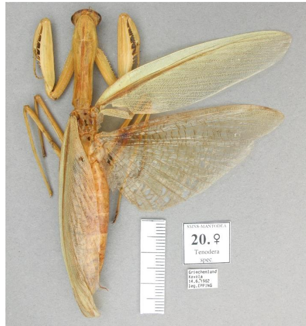
Fig. 13: Tenodera sinensis SAUSSURE, 1871 from Kavala, Greece.