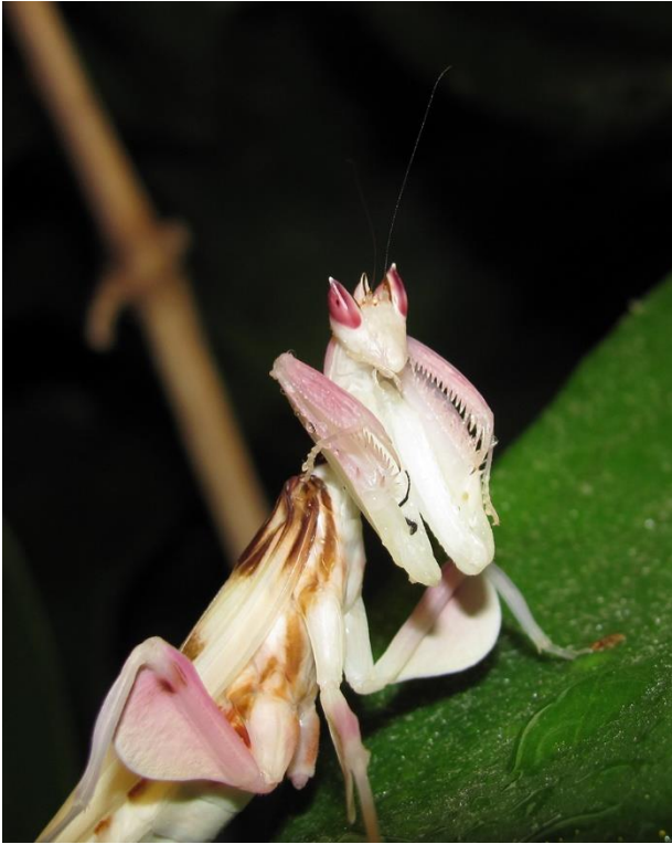
Fig. 8: Semi-portrait of Hymenopus coronatus (OLIVIER, 1792) perching in an apple tree in Karlsruhe; Photo: © P. Hartmann.