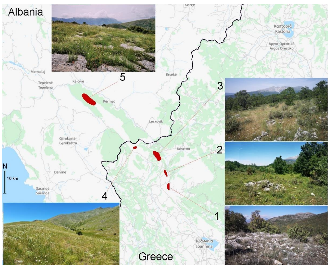
Fig. 2: Map of the fragmented distribution of P. willemsorum with photos of biotopes

The most characteristic plants are represented by Lamiaceae which are often dominant in all the localities sampled for P. willemsorum and P. azami : Thymus spp., Salvia officinalis , Satureja montana , Lavandula latifolia , etc. In addition, certain plants with steppe affinities such as species of the genus Juniperus ssp. or the Poaceae such as Stipa pennata are also among the most common plants recorded at these localities. The following plants are present in more than half of the localities of P. willemsorum and can be used as potential indicators, if associated with others: S. pennata , Thymus spp., S. officinalis and Juniperus spp. The following plants, which are only present at some of the areas, seems to be no indicators: Ostrya carpinifolia , Quercus trojana , Pistacia terebinthus . These plants indicate changing habitat conditions.